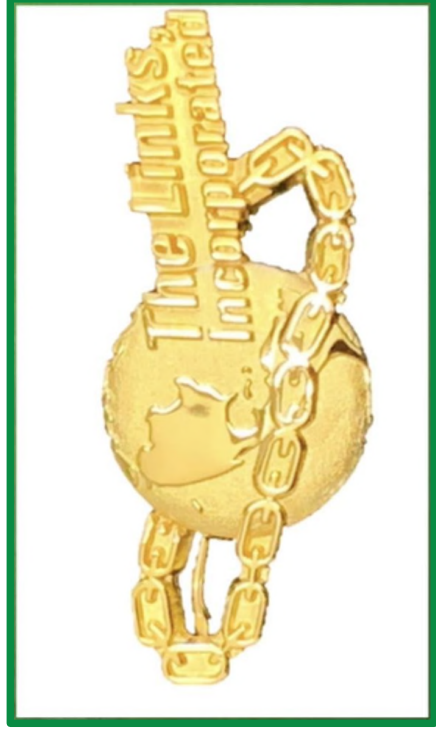
Official Links Pin