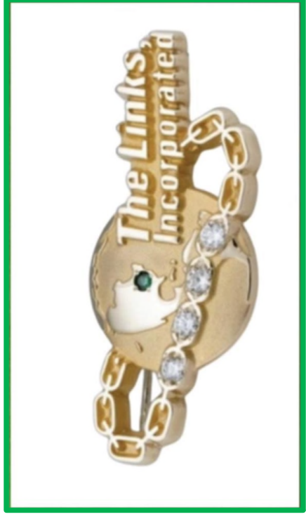
Official Links Commemorative 75th Anniversary Pin