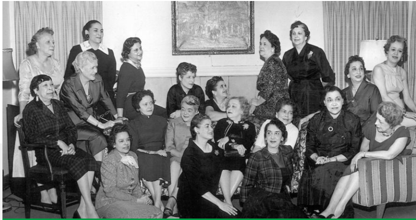
Founders of the Detroit (MI) Chapter